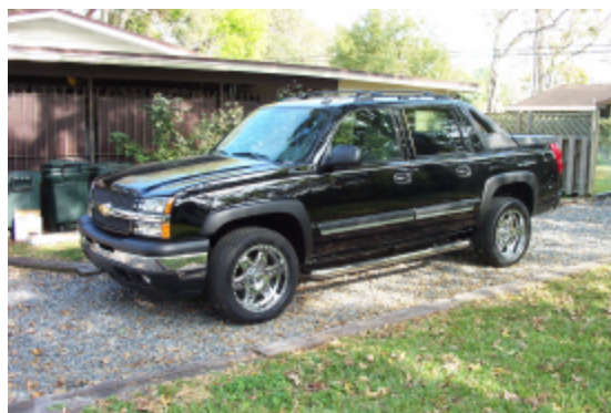
Jim Q. '06